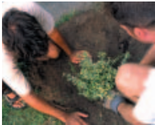
Neighborhood members planting shrubs provided by the program

Neighbors determine where and what kind of project they wish to undertake.