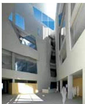
Architectural rendering of the lobby filled with daylight.

The structure rises above the Grove Street Cemetery. The New Haven Green is visible beyond and, to the northeast, the building visually communicates with Ingalls Rink and Kline Biology Tower.