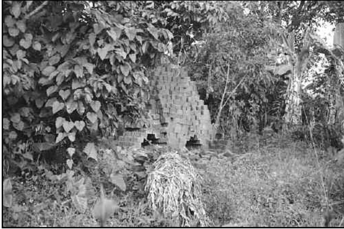
Brick burning is one of the ways villagers use forest resources to provide a cash income.