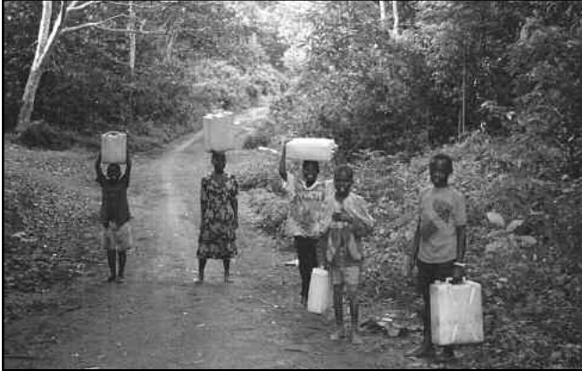
Children from Kitoola going to get water from a spring in Mabira forest.

land that can be used for fuelwood must either harvest it from Mabira, get it from charitable neighbors, or purchase it. In Kitoola, a small bundle of firewood costs about 1,000 shillings. The largest marketers of firewood seem to be SCOUL workers supplementing their incomes. Several different farmers reported that these workers go into Mabira in groups of thirty to forty and emerge with immense loads of wood that they then sell at a high price. Villagers seem to find the price justified, however, citing the risks that these workers are taking by entering the forest.