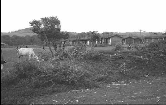
Housing for SCOUL plantation workers, known as “lines.”

between the owner and the two fishers. For example, if a team catches thirty-two fish, the first twenty go to the boat owner. The remaining twelve are split as follows: six for the boat owner, three for each fisher. The fisher sells his or her portion of the catch upon returning to shore. Due to this arrangement, many fishers have days when they receive no pay for a full day’s work.