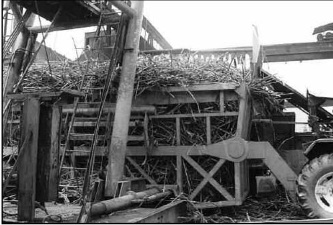
Sugarcane brought to the SCOUL factory for processing.

Currently, there is an excess of bagass, and it is simply spread back onto the cane fields. One official suggested that perhaps this bagass could be made into cakes and given to the workers to burn for cooking. While this would certainly help relieve the pressures workers put on Mabira for their fuel needs, it still leaves the larger issue of the necessity of supplemental income unaddressed. Being paid below a living wage, these workers cut trees for timber and firewood from the forest to earn enough money to subsist.