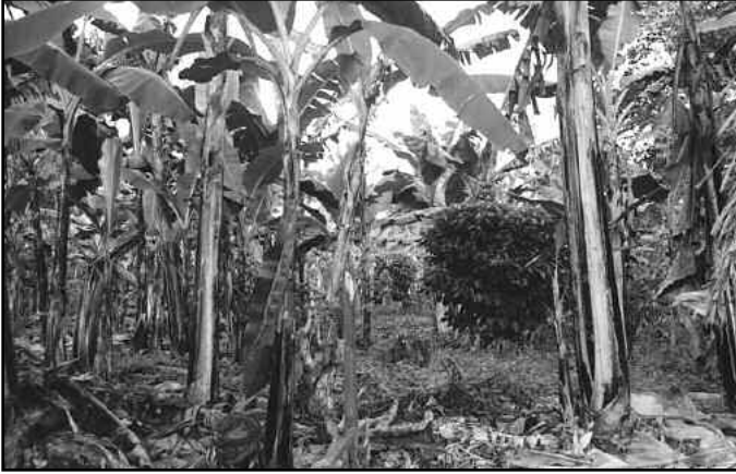
A typical garden. Matooke is dominant, with coffee and several varieties of potatoes also present.

money is sometimes a constraint. A few farmers reported that they do not have enough land available to plant trees: “If we have many trees in the garden, we will starve”. “I have very little land. It is not worthwhile for me to plant trees. I need food as well.” Others have said that even though their land is rented, if they talked with the landowner they would be allowed to plant trees.