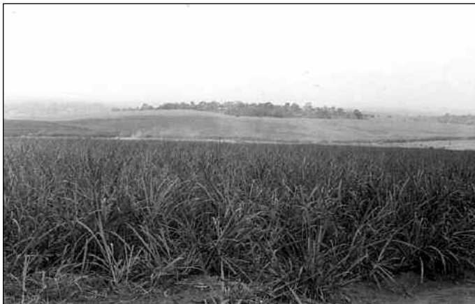
Buwuma village is located in the forested area in the background, with sugarcane in the foreground.

In 1977, when the current local chairman was born, there were eighteen households in Buwuma. When the sugar corporation would bring new workers to the plantations, it would house them in apartment-like rows, called lines, but many would leave and buy land in the area. As a result, Buwuma is composed predominantly of people of non-Baganda ethnic groups from various areas in eastern Africa. The area has also absorbed many refugees from the Democratic Republic of Congo. As reported by the local chairman, the village's composition is roughly as follows: 55 percent Congolese, 25 percent Ugandan (of these, very few are Baganda, the tribe native to the area), 5 percent Kenyan, and 5 percent Tanzanian. He was unable to characterize the remaining 10