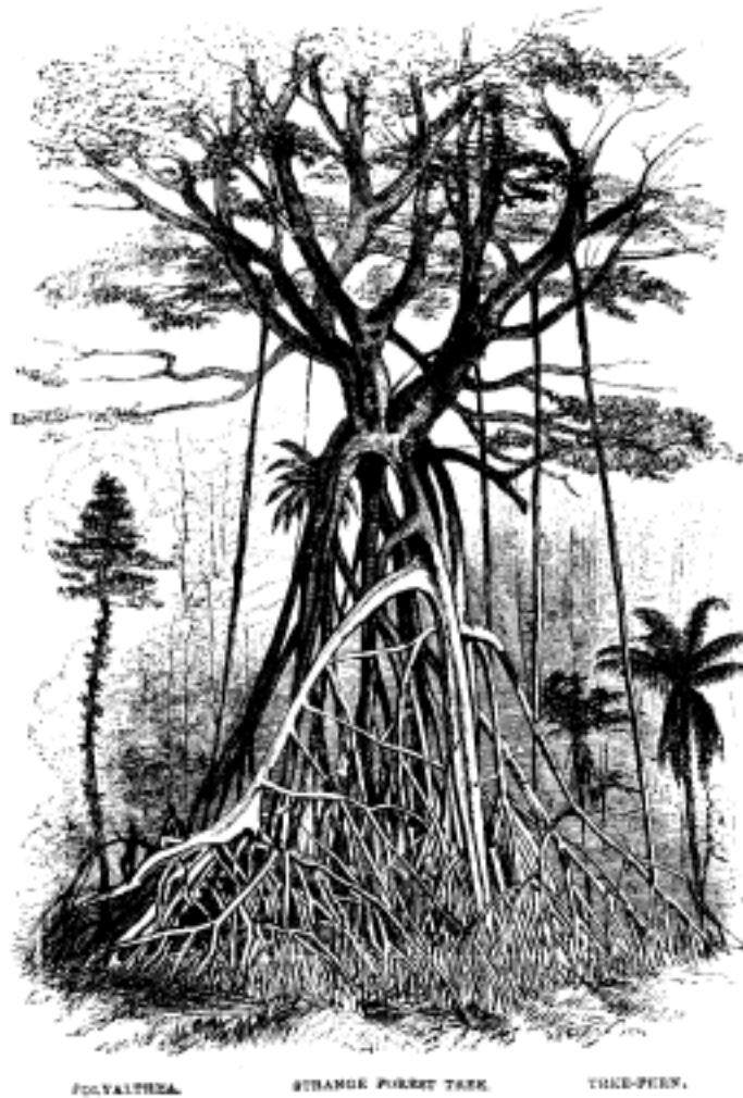
Alfred Russel Wallace. 1869. The Malay Archipelago: The Land of the Orang-Utan and the Bird of Paradise. A Narrative of Travel, with Studies on Man and Nature . Harper and Brothers, New York.

WWF. 2003. 'Chonga' Good Wood News Issue 2. People and Plants Campaign to Promote Sustainable Woodcarving in Kenya. April 2003. People and Plants Initiative, WWF East Africa Regional Programme Office. http://peopleandplants.org/whatweproduce/newletters/apr2003.htm