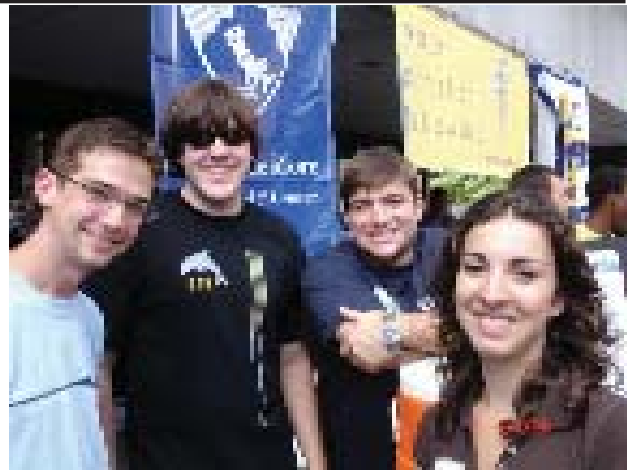
Undergraduate Council Members welcome new students at the Frosh Bazaar. (August 2006)