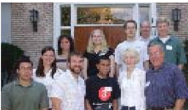
Some graduate students pose for a picture at the end of the day during the Graduate Retreat at Mercy Center. (September 2006)