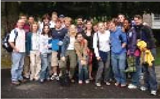
Undergraduate students pose for a picture at the end of the day during the Undergraduate Retreat at Mercy Center. (September 2006)