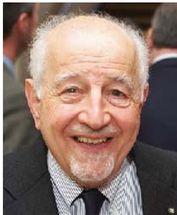
Judge Guido Calabresi