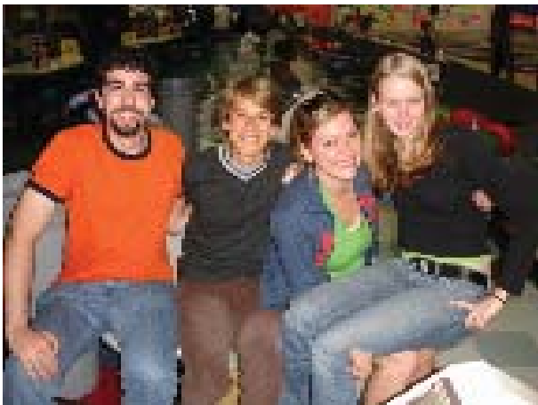
Undergraduate students enjoy an evening of bowling. (October 2006)