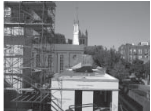
The view from the second floor library of the new center looking north toward Saint Thomas More Chapel. The 30,000 square foot center is designed by Cesar Pelli & Associates and will house an expanded Catholic intellectual and spiritual ministry.