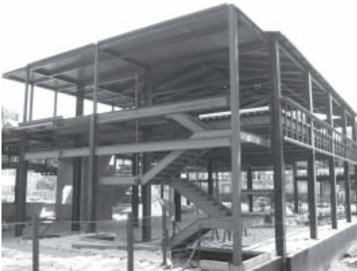
The Thomas E. Golden Jr. Center is well under construction and is expected to be completed in the Fall of 2006.