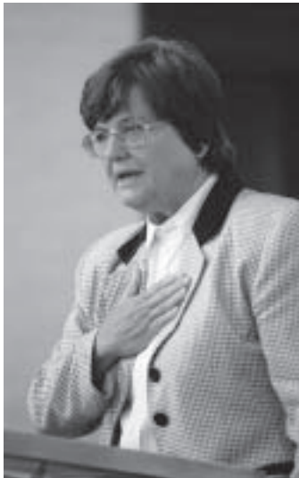
Sr. Helen Prejean, author and anti-death penalty activist

for having had the chance to serve in this capacity. The Co-Chairs oversee all of the student-led ministries at the Chapel. We run the bi-weekly meetings of the UGC and offer our support to anyone who might need it; we serve as liaisons between the Board of Trustees and the Undergraduate Council communicating to the Trustees the sentiments of the student body on various issues; and we agree to be representatives for the student constituency at the Chapel by attending lectures, benefits, and other programs sponsored by STM as often as possible.