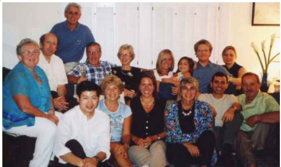
Some members and friends of the staff of Saint Thomas More Chapel and Center.