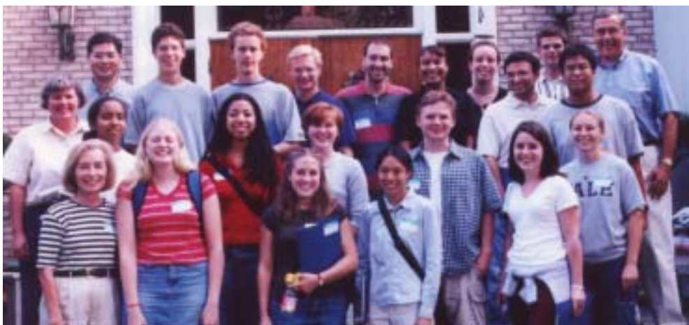
Some members of the Saint Thomas More community on an undergraduate retreat at Mercy Center in Madison, CT.

cially when I would be too caught up in my ambitions for a future career or overwhelmed by the demands and fast pace of the university, it was—and is—so good to be reminded that genuine success consists of loving; that real power comes from serving; that the only way to be truly free is to seek the will of God. Saint Thomas More Chapel is a place for me to grow in spiritual strength, inner peace and meaningful friendships. No wonder, you may say, that I am so happy to stay!