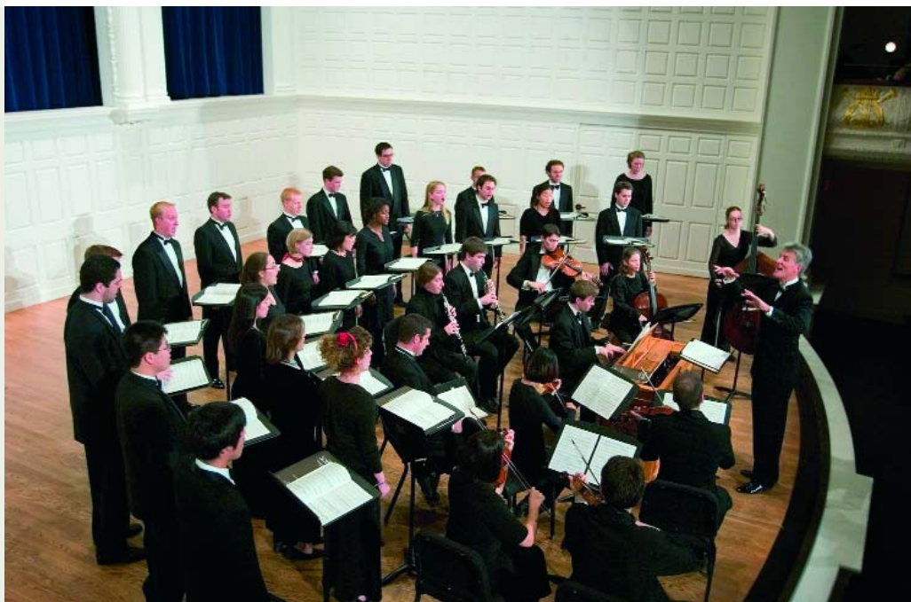
The Schola Cantorum performs with Yale Collegium Players

When aspiring young singers consider formal musical training, they might look to a college specialising in music or to the music department of a large university, where academic research, performance and music-education could be united; though the sine qua non for many still remains the conservatoire or Hochschule, those hallmarks of musical excellence from Naples to Paris, Moscow to London and on to New York. But as we now know them – though tend to forget – these conservatories are largely a 19th-century invention, designed in an era obsessed with the child protégé, whose principal raison d'être was the fostering of solo as well as rank-and-file talent for the burgeoning orchestras and opera houses at the