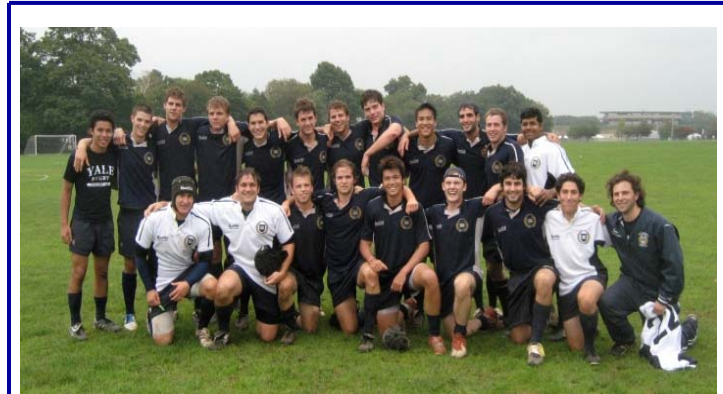
The 2006-2007 Yale Rugby Club A-Side squad after beating Harvard 17—16 in a home game on September 23rd.

Moreover, the team accomplished a goal that all Yale clubs, past and present, set at the beginning of the season. They did this with a 17-16 victory over Harvard on their home pitch on September 23 rd . The victory marks the first time in six years that an Eli squad has beaten the Crimson (a feat that it would repeat in their traditional game before Thanksgiving). It is also only the third win in the last fifteen meetings between the teams. However, even though the Yale squad defeated Harvard in regular season play, it would be Harvard that advanced to nationals. This happened as a result of the