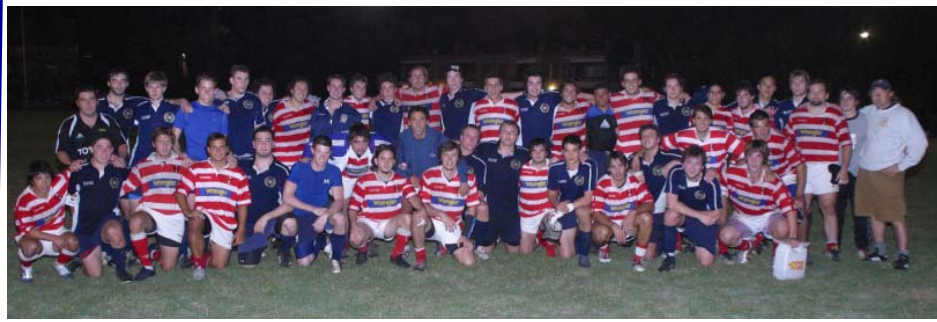
The Yale Rugby team poses with the "Alumni" team of Argentina during tour last spring break. This year, the team will travel to the Bahamas.

On rare weekends when Yale Facilities won't allow matches due to heavy rain, the players still enjoy tearing up parts of Old Campus as they slide around the grass playing pick-up rugby games while bewildered freshmen look on from their rooms. Last spring break, the team traveled to Buenos Aires, Argentina to learn a hard-nosed forwards game from their local clubs and coaches. This spring, Yale Rugby will return to the Bahamas where they will enter into a tournament against several Bahamian sides and other US teams traveling to the same area. At the end of the year, the team will be