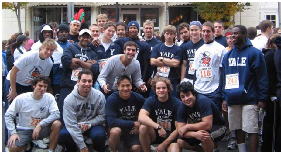
PHILANTHROPY: The Yale Rugby team getting together for a picture before a Sunday morning charity 5km run benefiting the Yale-New Haven Children's Hospital.

Off the field, the Yale Rugby team also plays host to events such as mixers with other campus groups and an end of the season formal for the players to bring their dates.