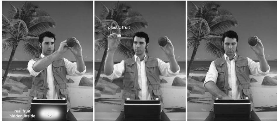
Fig. 2. Depiction of an example experimental presentation. The presentation began with a real piece of fruit concealed inside the box (left). The experimenter then removed a piece of plastic from one kind of fruit (center) and pretended to place the piece into the box (right).

Once the fruit was presented, the experimenter allowed the subject to view it for two seconds. He then removed the white plastic piece from behind the fruit. To a human observer, this appeared as though the presenter had removed a chunk of the fruit, despite the fact that the actual object was just a piece of white plastic. The presenter placed the plastic piece inside the box. He then surreptitiously removed the plastic piece from the box, turned around, and walked away from the box to a distance of 5–10 m, allowing the subject to approach. Subjects were then allowed to search the box, find the piece of food hidden inside the box, and then continue searching. The cameraperson (who was blind to the experimental condition) determined that the subject had completed this second period of search when either (1) the subject stopped searching for one full minute, or (2) the subject moved more than 2 m away from the box.