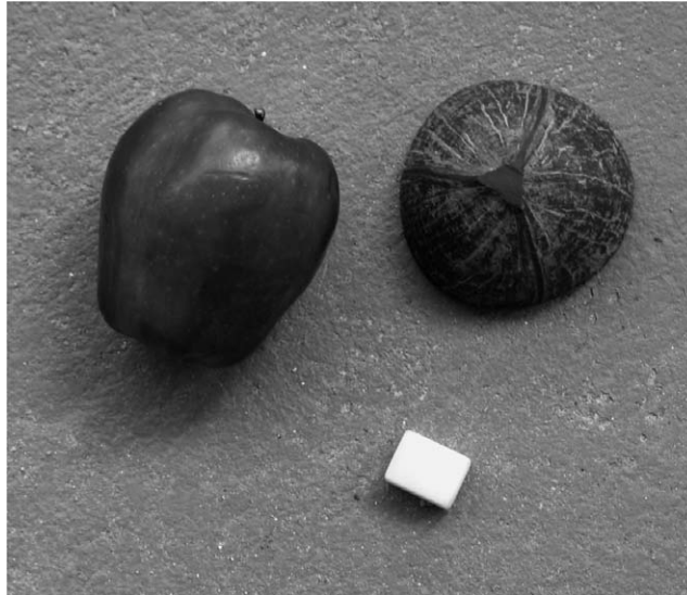
Fig. 1. A photograph of the stimuli used in this experiment. Subjects saw a white plastic piece (center) emerge from either the apple (left) or the coconut (right).