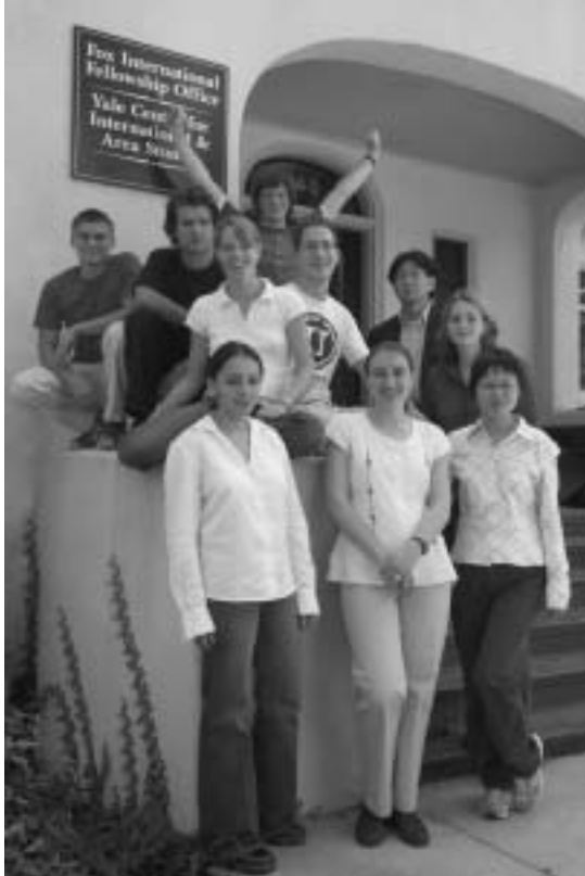
The 2003-04 incoming Fox Fellows on the steps of 340 Edwards Street, headquarters of the Fox International Fellowships program.

D esigned to enhance the education of future international leaders, the Fox International Fellowships Program is a student exchange partnership between Yale University and seven of the world's leading universities including: