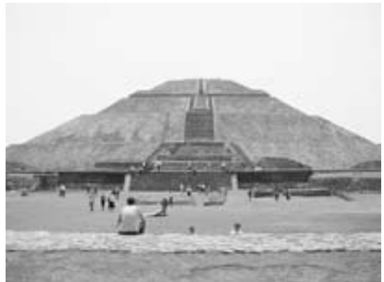
Teotihuacan, Pyramid of the Sun.

navel of the world, the ghost town of Teotihuacan where the giant pyramids of the Sun and the Moon wow the visitor. According to Aztec myth, time began here; and when we climbed the temple stairs