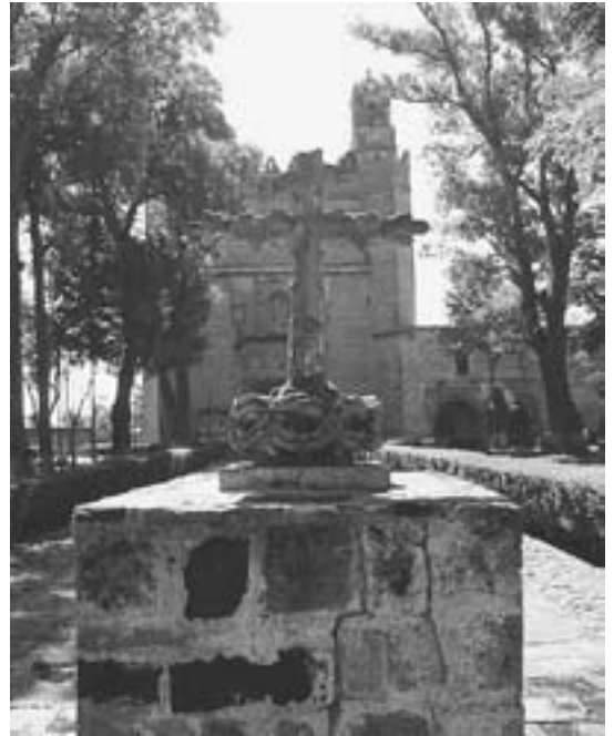
Cross in the courtyard of the Monastery of St. Michael the Archangel in Huejotzingo.

Outside only birds continue the song of praise. Where are those for whom the cross was made? Do they know these hazy whitewashed walls once held the bright tones of their own sweet songs of praise? Perhaps they need a reminder. Perhaps we must set these walls ringing to bring the church to life again.