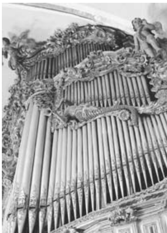
Detail of the organ of Santa María Magdalena (San Martín Texmelucan), featuring elegantly painted pipe mouths and one of two trumpet-wielding (and playing) mermaids crafted onto the façade.

I look forward to returning to Mexico very soon, and I am not lacking in appropriate motives. Within the next decade, both the Gospel and the Epistle organs in the Catedral Metropolitana will have been restored, many other instruments in Mexico will likely have enjoyed similar attention, my conversational Spanish will be, well, more conversational—and I’m confident that I’ll have many colleagues eager to join me.