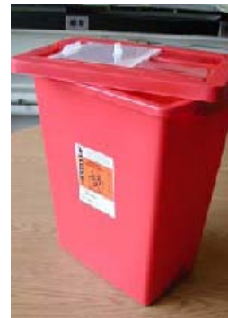
8 GALLON RED SQUARE CONTAINER FOR COLLECTING MEDICAL WASTE IN CLINIC ROOMS OR IN LABS IN BCMM 3 RD AND 4 TH FLOORS THAT REQUIRES AUTOCLAVING