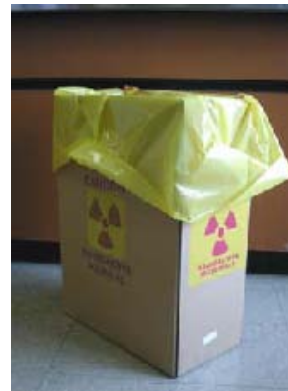
RAD WASTE BOX/BAG UNIT ½ SIZE FOR DRY WASTE COLLECTION, MEDIUM SIZE 19" X 9.5" X 25"