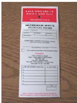
HAZARDOUS WASTE TAG LOCATED IN STOCKROOMS