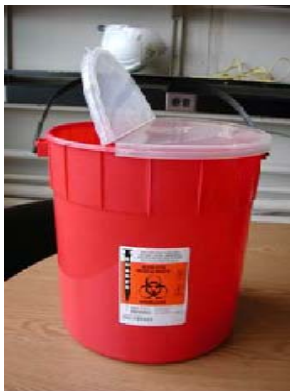
RED BUCKET FOR COLLECTING MEDICAL WASTE THAT REQUIRES AUTOCLAVING.