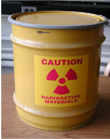
11.3 GALLON STEEL DRUM FOR RAD WASTE LSV COLLECTION 17" HIGH