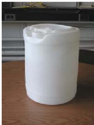
FIVE (5) GALLON CARBOY FOR SOLVENT WASTE (20 LITER)