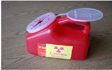
ONE (1) GALLON RAD WASTE SHARPS CONTAINER