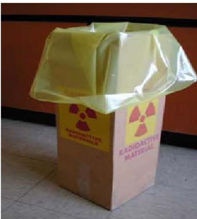
RAD WASTE BOX/BAG UNIT ¼ SIZE FOR DRY WASTE COLLECTION, SMALL SIZE 9.5" X 9.5" X 25"