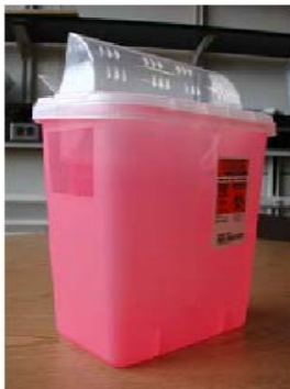
NEEDLEBOXES FOR LAB BENCH TOPS