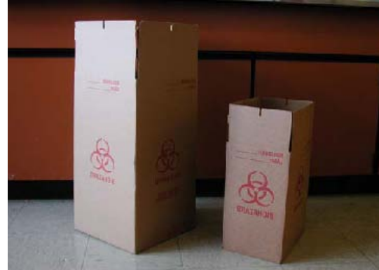
SMALL & LARGE MEDICAL WASTE BOX/BAG UNIT FOR COLLECTING WASTE THAT GOES THROUGH NEW AUTOCLAVE SHREDDER PROGRAMS. *NOT SCIENCE HILL. (Self service in areas where the autoclave bins are located.)