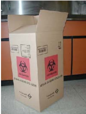
STERICYCLE BOX/BAG UNIT FOR OVERPACKING RED BUCKETS, AUTOCLAVE BAGS OR NEEDLE BOXES THAT REQUIRE DISPOSAL BY OFFSITE VENDOR.