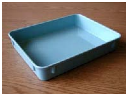
BLUE SECONDARY CONTAINMENT TRAY FOR HAZARDOUS WASTE BOTTLES