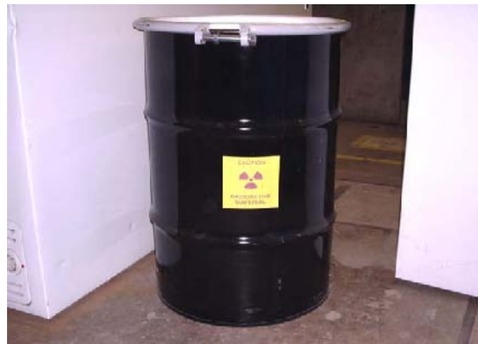
THIRTY (30) GALLON STEEL DRUM FOR RAD LSV COLLECTION 29" HIGH