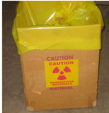
RADWASTE BOX/BAG FULL SIZE FOR C-14 / H-3 DRY WASTE COLLECTION 19" X 19" X 25"