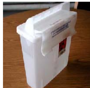
5 QUART NEEDLEBOX FOR WALL HANGING UNITS IN CLINIC AREA