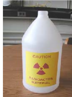
ONE (1) GALLON LIQUID RAD WASTE JUG (4 LITER)