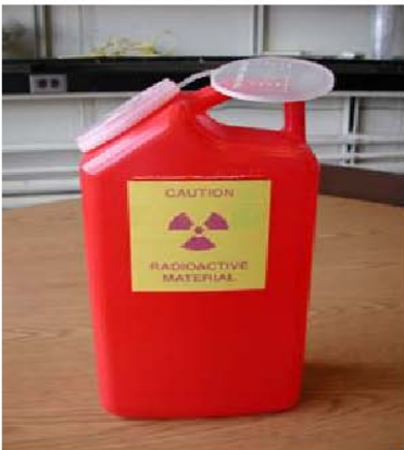
THREE (3) GALLON RAD WASTE SHARPS CONTAINER