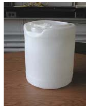
FIVE (5) GALLON LIQUID RAD WASTE CARBOY (20 LITER)