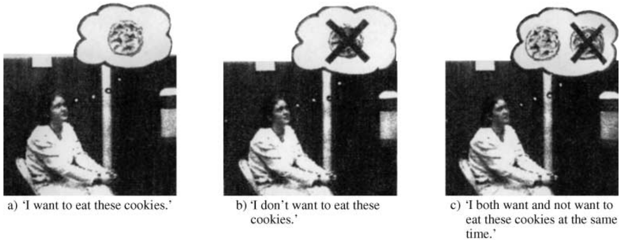
Figure 2 Pictures and corresponding states of mind presented in the Cookie condition in Study 2. Pictures (a) – the Want state and (b) – the Not Want state – showed the presence of one state of mind while Picture (c) illustrated a conflicting state of mind – the Internal Conflict state.