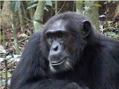
Ngogo, Kibale Forest, Uganda, is the home of the largest concentration of wild chimpanzees in the world