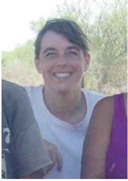
Assistant Professor, Department of Anthropology, University of Pennsylvania, CHaPRE Research Affiliate