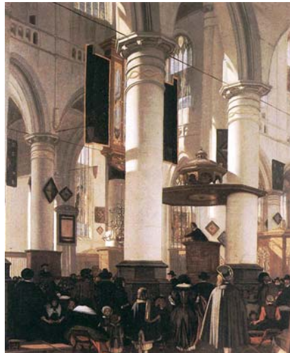
'Interior of a Church,' Emanuel de Witte, Holland, c. 1668

NB: The amount of preparation for the rough draft/prospectus is entirely up to you, but bear in mind that this is an opportunity to receive detailed feedback from me prior to receiving a grade. The more you do initially, the more feedback I can give and the less you will have to do at the end of the semester. I will set aside time during the week following the break to review your work and discuss it in detail, if you wish.