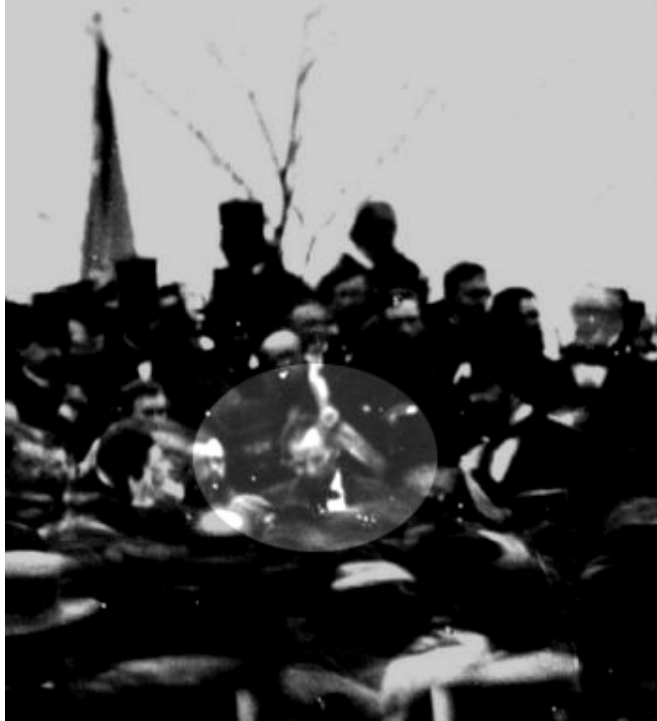
The only known photo of Abraham Lincoln at the dedication of the Soldiers' National Cemetery in Gettysburg, Pennsylvania, on November 19, 1863